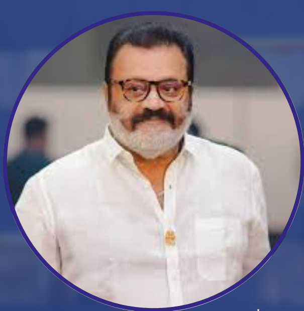
Shri Suresh Gopi* Hon'ble Minister of State for Tourism Government of India